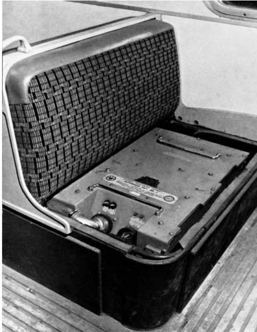
Figure 3 - Original Victoria Line Autodriver Box Installation

If dual-fitting of equipment rooms is required, then space within these rooms is of critical importance. If interlockings are to be replaced, then in the majority of cases the new interlockings will be