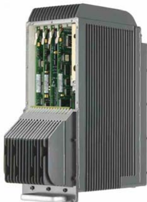
Figure 4 - One ATP Lane of TBS100 Train Carried Equipment

The product that WRSL is applying to allow this overlay migration strategy to be implemented is the Invensys Rail Systems CBTC ATP and ATO platform, TBS100. In this application signalling information related to block proceed and block