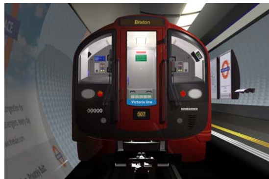
Figure 1 - New Bombardier Rolling Stock for Victoria Line

Contractors, Consultants and Railway Authorities have become expert in using construction management techniques in order to develop these systems in very short timescales, often incorporating and commissioning completely new forms of signalling, train control and traction technology as the projects have proceeded. The result has been a rapid expansion in system capability, and the evolution of extremely high-ridership, high performance railways.