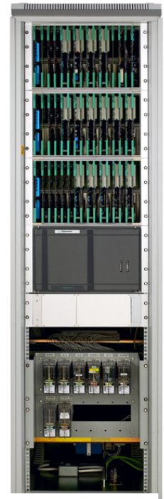
Figure 5 - WESTRACE Vital Processor Technology

WESTRACE vital processing equipment is used as the enabling technology for the migration method adopted. In the overlay solution WESTRACE is installed close to the existing interlockings. It is used as a vital parallel to serial conversion medium, taking parallel outputs from the existing electro-pneumatic interlockings and converting these into serial messages to be used by the ATP Block Processor. This in turn passes a broadcast message to all trains through the radio system. A typical WESTRACE installation is shown in Figure 5, and a single lane of TBS100 in Figure 4.